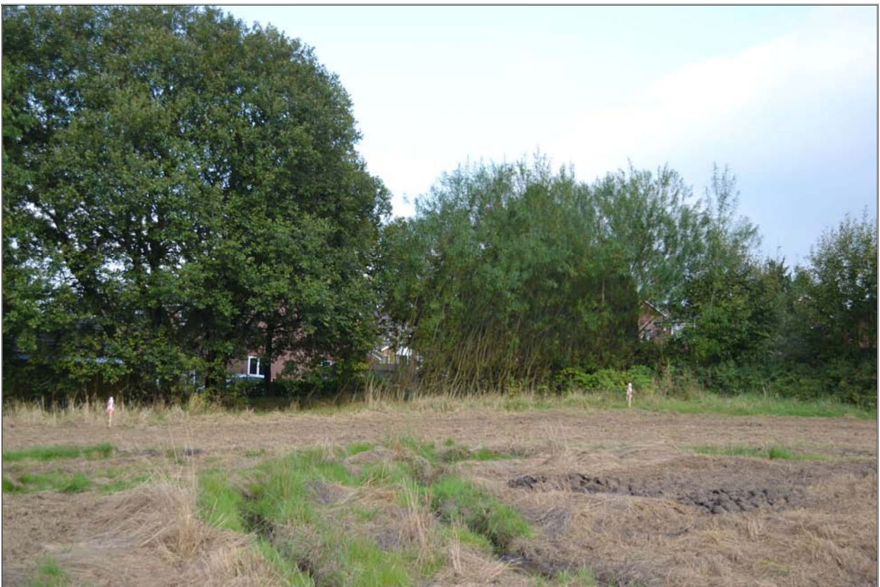
Building Plot adj, 11 Goose Green Avenue, Coppull, Chorley, PR7 4QD