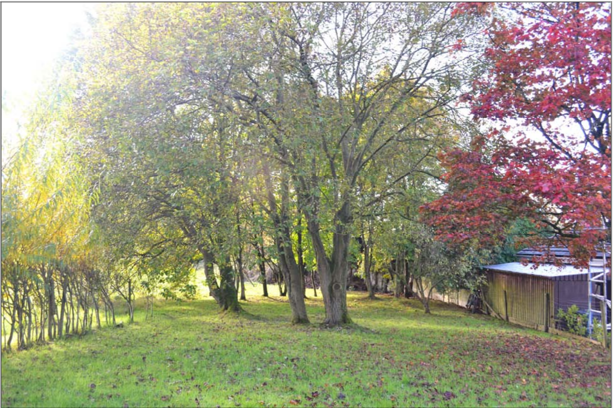
Building Plot adj, 11 Goose Green Avenue, Coppull, Chorley, PR7 4QD