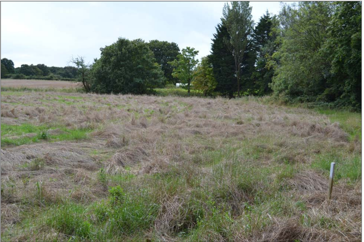
Building Plot adj, 11 Goose Green Avenue, Coppull, Chorley, PR7 4QD